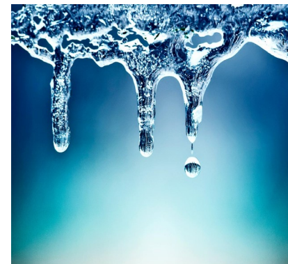
Melting ice