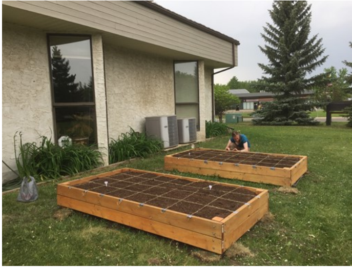
Late May 2019