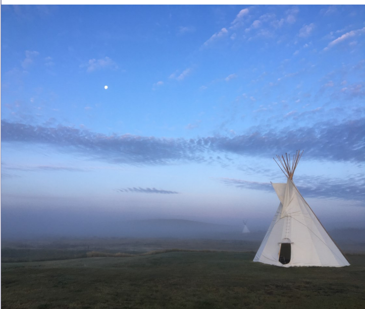
Made of the Mist