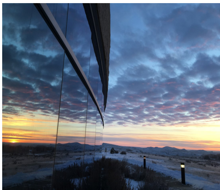
Symmetry of the Morning